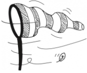
it is windy