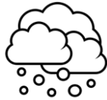
it is snowing