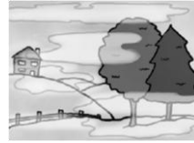
it is foggy